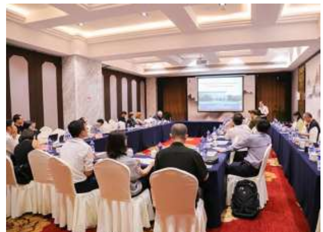
A well-attended panel session