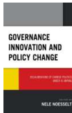
Governance Innovation and Policy Change Recalibrations of Chinese Politics under Xi Jinping

Fueled by its surging economic strength, China has been increasingly utilizing economic tools such as trade, foreign aid, foreign direct investment, and sanctions to pursue strategic and security interests on the world stage. This approach, known as economic statecraft, has thus far received mixed policy results and ambivalent reactions from the international community. This book presents a collection of global assessments of China's economic statecraft. The contributors to this volume answer three key questions: What are the challenges faced by China's economic statecraft? Why is China sometimes able to achieve its foreign policy objectives via economic statecraft and sometimes not? How do foreign countries, particularly the targets of China's economic statecraft, respond to China's strategies? This comprehensive study examines economic statecraft in the context of more than a dozen nations and international organizations across four continents, thus providing a truly global perspective.