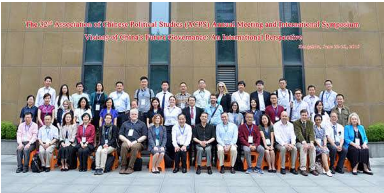
Participants in the annual meeting and international symposium

The conference closed with an ACPS Business Meeting whose topics included growth, professionalization and institutionalization of ACPS; publisher matters concerning the Journal of Chinese Political Science ; networking, future research, and collaboration; and new membership recruitment. Participants in the conference came from universities in China, the United States, Canada, Austria, Germany, Hong Kong, and South Korea.