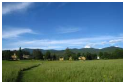
Middlebury's Bread Loaf campus

1.) ACPS's next annual meeting and international symposium will be held September 19-20, 2020 at Middlebury's Bread Loaf campus in Vermont. This conference will focus on mentoring, as did the 2019 Zhejiang University one, but will also have sessions to discuss new methodologies in Chinese politics and publishing with a panel of editors. A call for papers will go out in January.