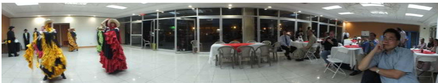
Closing ceremony of the 2013 conference at UCR with dancers in traditional Costa Rican costumes entertaining the conference participants.

I am looking forward to seeing old friends and making new ones at the future ACPS meetings and events. ■