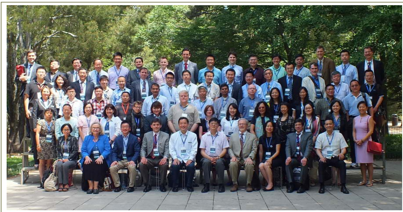
Part of the participants in the conference.