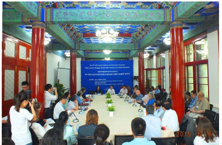
Opening ceremony in the North Building at Peking University.

This timely and stimulating conference attracted 75 participants from 17 countries and regions, including U.S., Russia, Germany, Singapore, Pakistan, Mexico, Colombia, Chile, Canada, South Korea, United Kingdom, Israel, Japan, mainland China, Taiwan, Hong Kong and Macao. Presentations were given by academics, doctoral candidates, and researchers associated