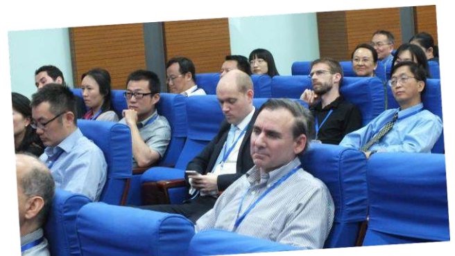
Conference participants and other audience at the Closing Ceremony.