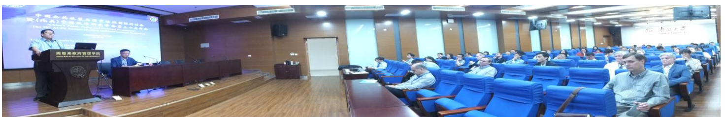
Closing Ceremony of the 30th Annual Conference of ACPS.