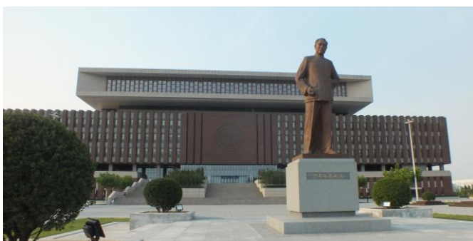
The main library of Nankai University.

Tianjin China, the site of the 30th annual ACPS meeting and international symposium, holds historical significance in China's interactions with the outside world. During the events of the Second Opium War (1856-1860), the Qing dynasty signed the Tianjin treaties, one of the infamous "Unequal Treaties," which gave concessions to six European countries, the US, and Japan to set up permanent trade access to Tianjin's port, churches and residences around the city, as well as diplomatic consulates in Beijing. For the first time in its history China was open to the world, and the world