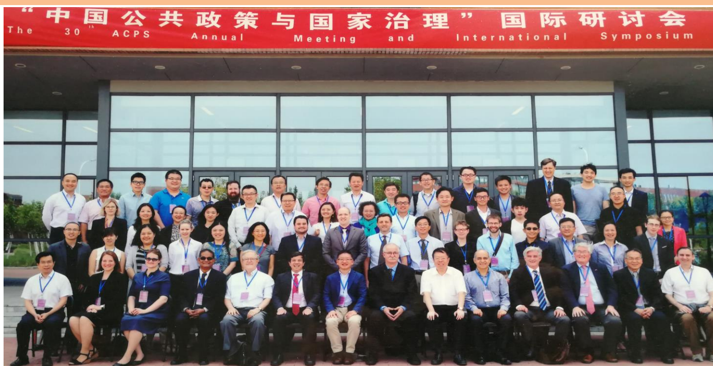
Participants on the first day of conference.